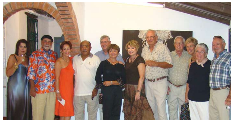
► The Puerto Vallarta Navy League